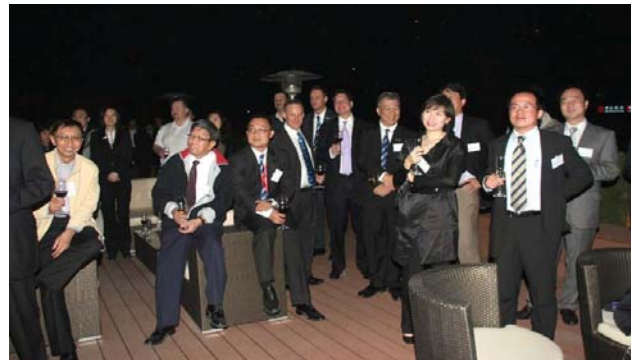
VIP event at Stiller's Restaurant on 18 March.